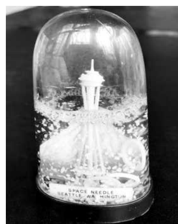
Not-so-great shakes: A Space Needle ringtoss snow globe.

The Style Conversational: The Empress's weekly online column reviews each new contest and set of results. Check it out at wapo.st/conv1374 .